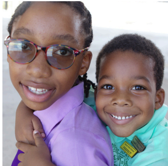
Caption: Captured photos of students in our partnership school, Goshen Primary

ANIDA's flagship program, Hope for Tomorrow (HFT), has been a resounding success. This program allows 151 children to receive a high-quality education, helping to end the cycle of poverty and enabling them to chase their aspirations. With a sponsorship rate of 98%, ANIDA ensures that every child in the program receives the support they need to succeed.